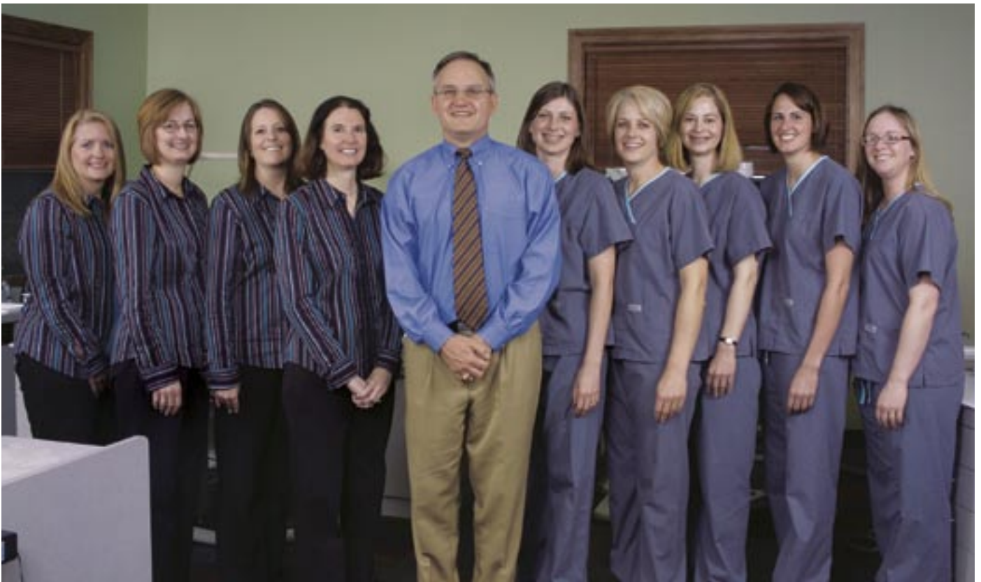
Snyder Orthodontics, established 1987, Apple Valley, MN