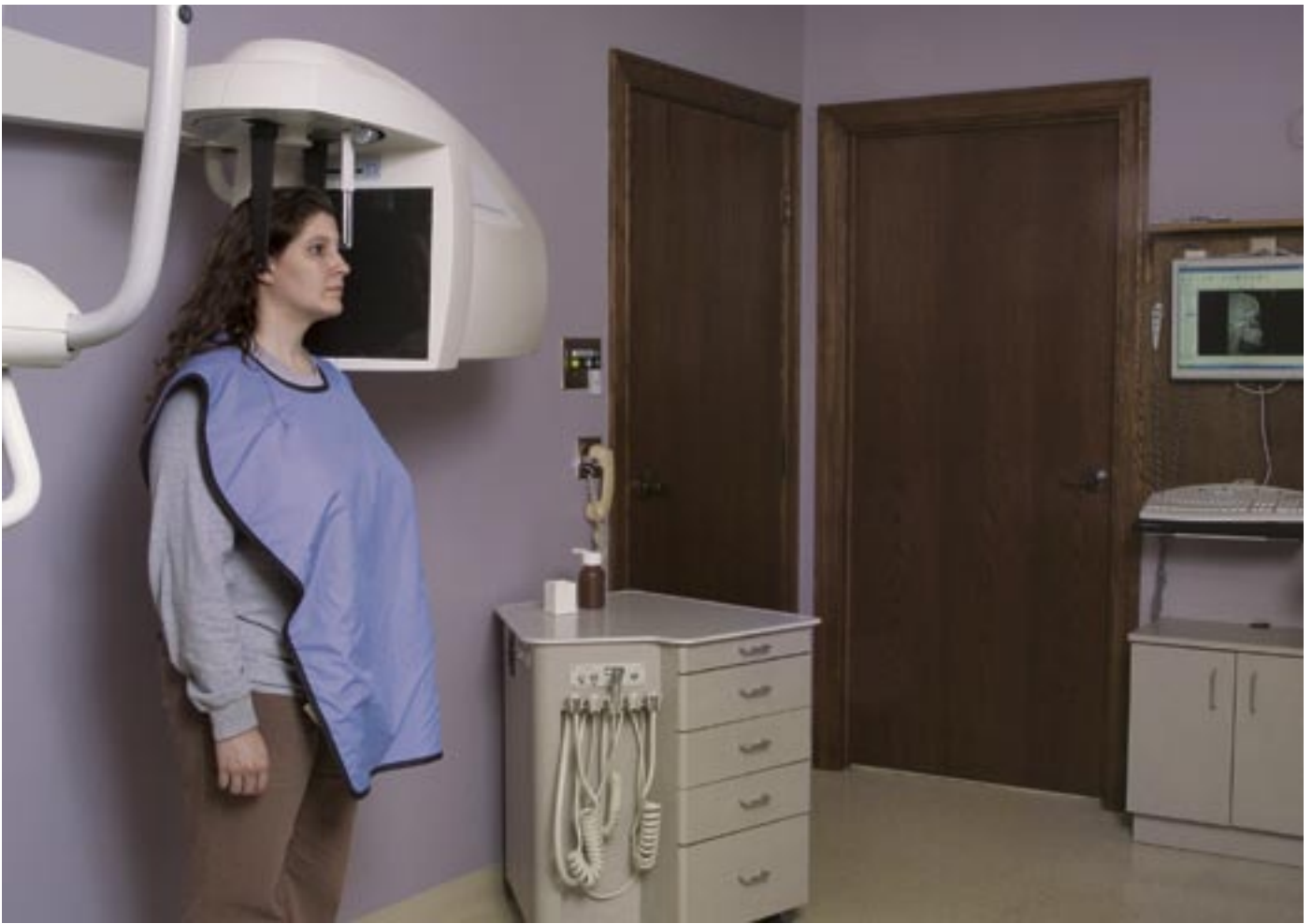
Lateral head film being taken with a Kodak 8000C digital cephalometric and panoramic system. Soon this will be outdated technology, as cone beam radiology will one day integrate SureSmile technology.