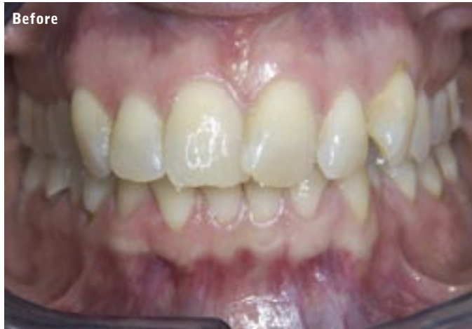
Arch collapse and space gained with nonsurgical palatal expansion followed by 11 months of braces with SureSmile.