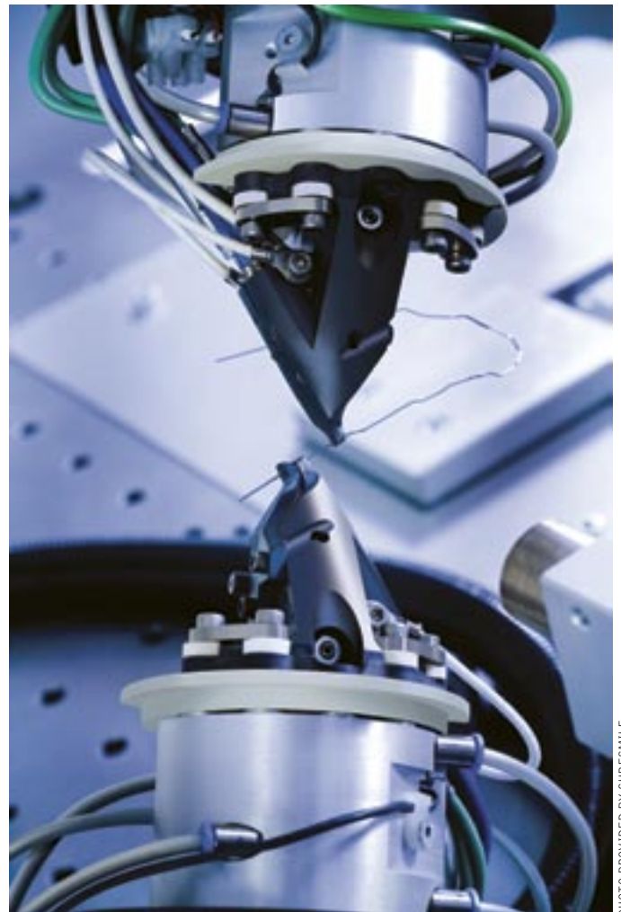
Robotic wire bending of fully customized copper nickel titanium orthodontic wire — a revolutionary merger of high-speed Internet technology, metallurgy and robotics